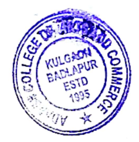
Principal In-Charge Prinsinal Adarsh College of Arts & Commerce Kulgaon - Badiapur (E).

This policy will be reviewed often to make sure it remains in line with new recommendations and opportunities for environmental stewardship.